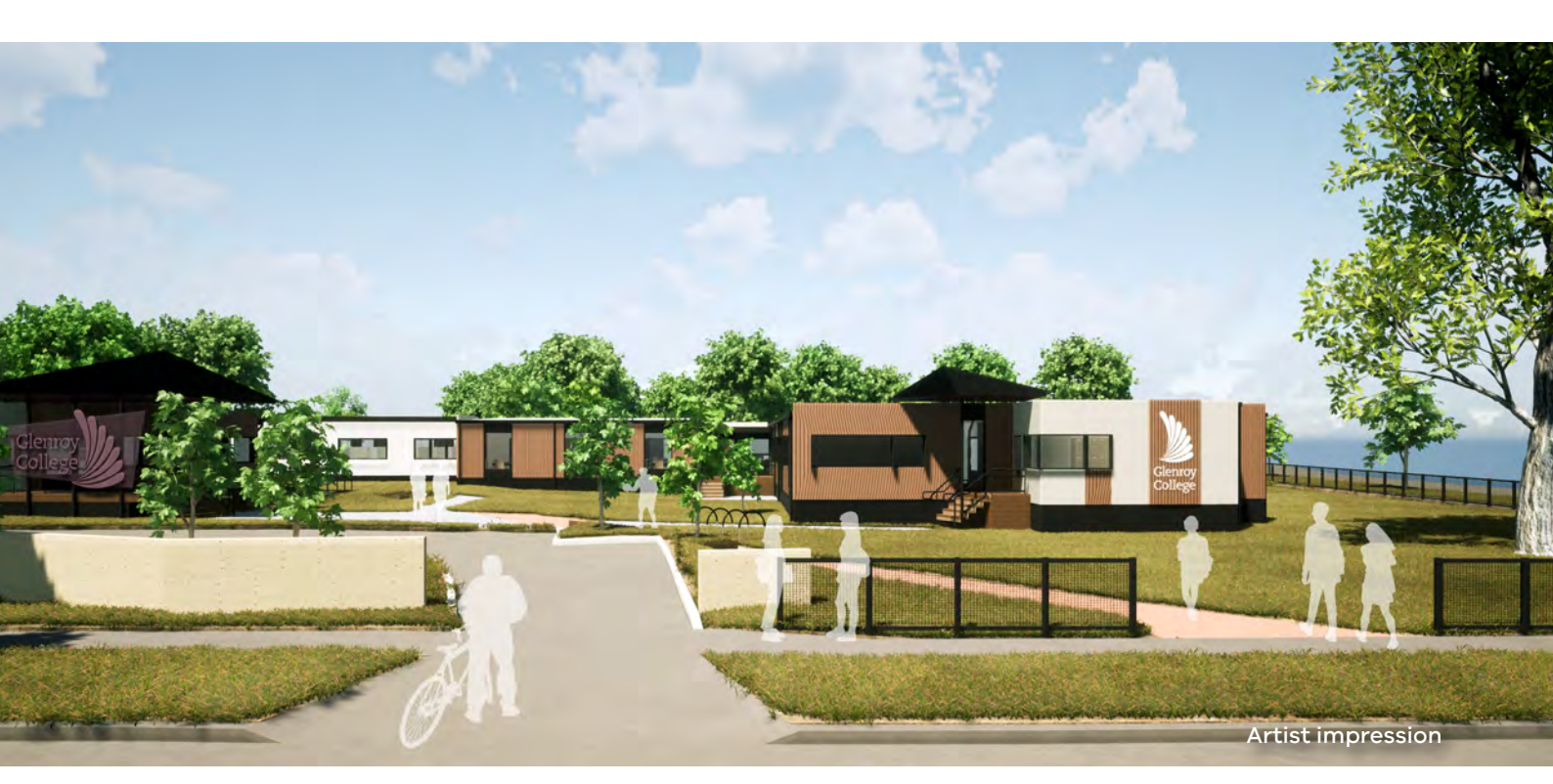
Glenroy College's new buildings will provide a welcoming and inclusive gateway to the school.

Glenroy College has a new senior and junior school, a state-of-the-art library (learning resource centre), administration centre and staff hub opening term one, 2021.