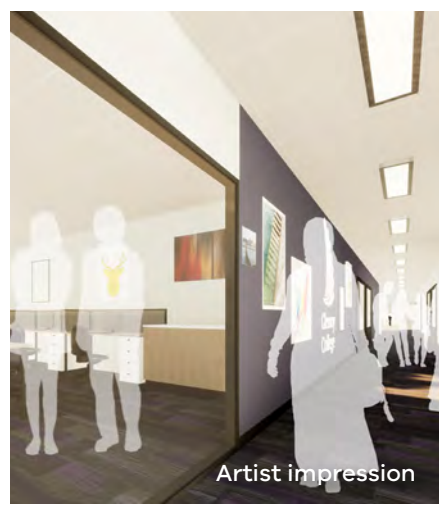
Senior learning centre (internal)