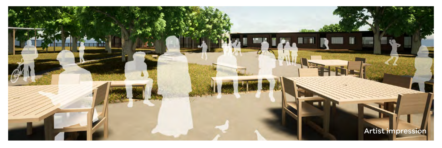
The junior and senior learning centres both feature central outdoor piazzas ('green hearts')